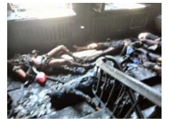
May 2014: The reality of Ukraine's Western-backed "democracy." Anti-government activists burnt to death in the Odessa Trade Union Hall.

the Azov Battalion led by Andriy Biletsky, the leader of the Neo-Nazi, Social National Assembly. The Social National Assembly calls for "struggle for the liberation of the entire White Race" and seeks to "punish severely sexual perversions and