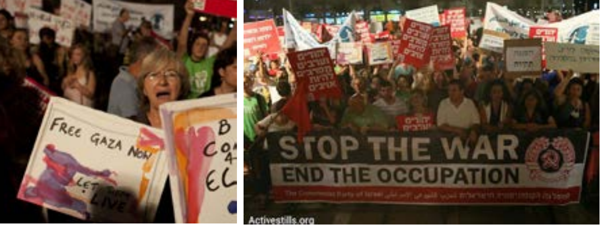
Tel Aviv, July 26: Up to 8,000 Israeli leftists brave threatened police repression to protest against Israel's genocidal attack on Gaza.