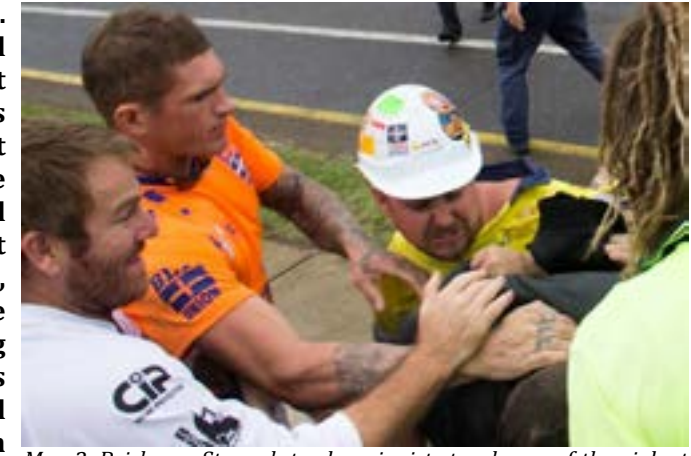
movement must unite local, 457 Visa and international workers May 2 , Brisbane: Staunch trade unionists teach one of the violent fascists a lesson in workers' power. The organised working class has the power and interest to decisively crush the fascists.

The working class needs to build a new leadership that can clarify and spread the lessons of struggles such as the 2 May 2014 Brisbane mobilisation to the entire union movement. Such a workers' party would use powerful internationalist-