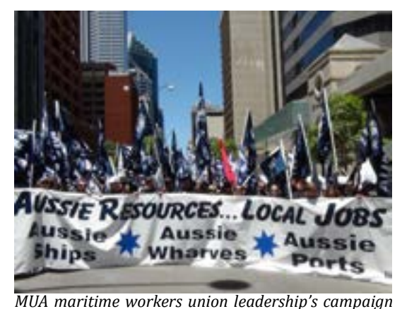
MOA maritime workers union readership's campaign for "Local Jobs" against overseas labour on local shipping. Such divisive campaigns set local workers against their overseas sisters and brothers and undermine the necessary workers' unity needed to defeat "multinational" corporate bosses through class struggle. The unions should instead focus the struggle on fighting for overseas workers to get the same wages and conditions as local workers and should unite all workers in industrial action to force the capitalist exploiters to cede improved conditions and more jobs for all.

workers' wages to the level needed to spread the available work around among all those who want to work.