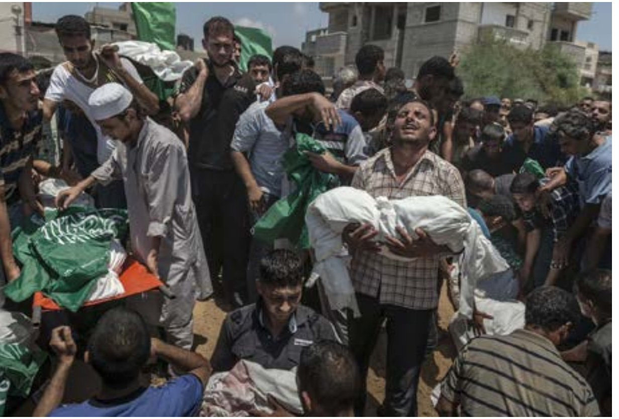
Palestinian men bury the bodies of members of the Abu Jamei family, who were killed in an Israeli airstrike on the southern town of Khan Younis in Gaza. At the family's home, people searching beneath the rubble left by the overnight attack counted 26 bodies, all slain by the immense Israeli killing machine which is backed both financially and morally by the U.S. and Australian imperialist ruling classes.

too because the governments that serve these exploiters are attempting to make people pay for doctor visits and to deny unemployed people under 30 access to the dole for six months a year. All this makes workers question everything the capitalist rulers do – including their foreign policy, a policy which includes fervent support for Israel. Let's also unite opposition to the Australian ruling class' backing for Israel's racist war against Palestinian people with the struggles against the Australian ruling class' own racist wars against Aboriginal people and refugees, along with its racist treatment of non-white "ethnic" and Muslim minorities. Mobilise mass opposition to the U.S., British and Australian rulers that back Israel's tyranny! Shake the imperialist branches that hold up the Zionists' nest so that it falls and the branches themselves weaken! Down with Israel's genocidal war on Gaza!