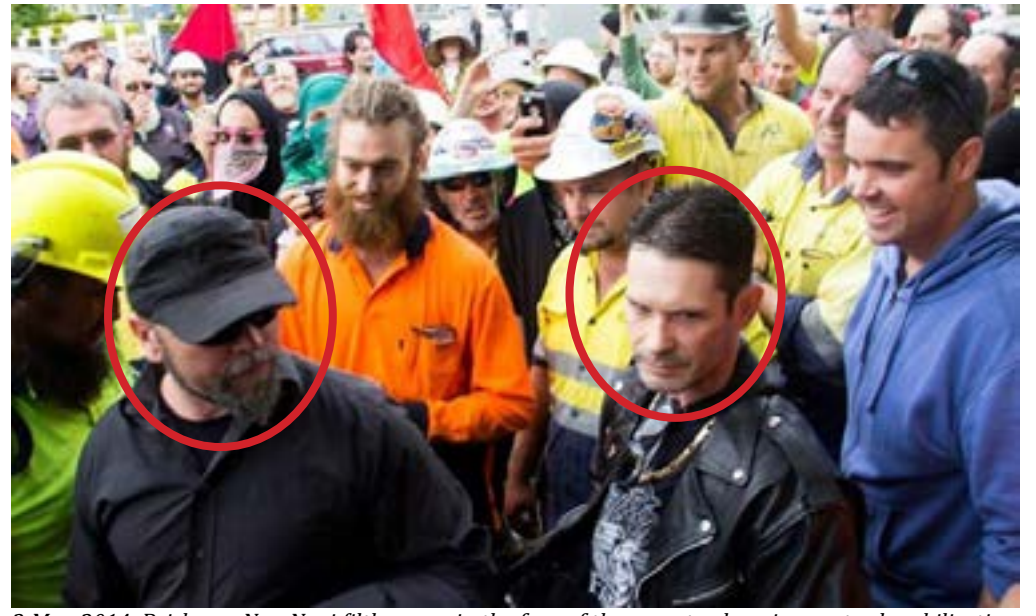
2 May 2014, Brisbane: Neo-Nazi filth cower in the face of the mass trade union centred mobilisation. The workers when truly united - and conscious of their collective class interests - can never be defeated.

prevalent in the workers movement - a nationalist consciousness promoted by the pro-ALP union tops that portrays overseas workers as rivals for jobs with Australian workers. This Laborite ideology see the union movement using divisive slogans such as "Stop exporting Aussie jobs overseas" and "Keep out overseas guest workers." Such slogans go against the principles of unionism and workers unity as they pit local workers against their overseas sisters and brothers. It sees one group of workers - local workers - looking to cut a separate deal with the bosses at the expense of another group of workers - overseas workers. Not only is this divisive but it harms the struggle for workers' rights. Politically savvy trade unionists know that even if the boss at a particular workplace is using the employment of one group of especially exploited workers (like young workers) to try and undercut working conditions, it is always destructive to workers' rights for the remaining workers to demand that the business owner favour them at the expense of the others. This only allows the boss to divide workers and distract them from the boss' sole responsibility