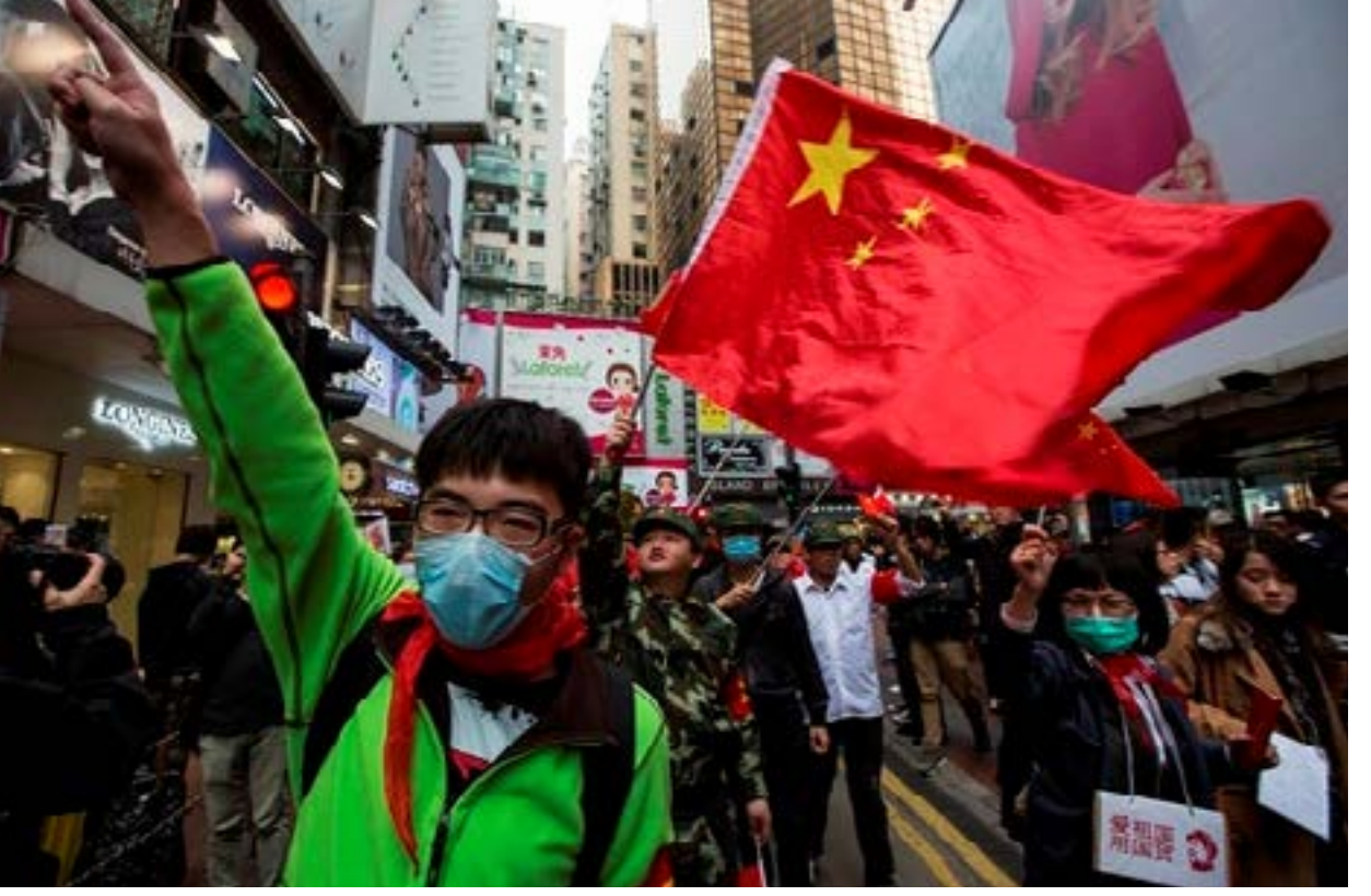
17 August pro-PRC rally in Hong Kong was attended by over 110,000 people.