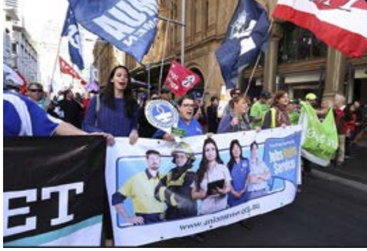
Sydney, July 6: Thousands of trade unionists and leftists march in opposition to the anti-working class budget of the right wing federal government.

Many are hoping that decisive sections of the budget will be blocked by the Senate. Any blocking of reactionary measures by opposition parties reacting to mass outrage would be welcome. However, in the absence of decisive class struggle action that forces all the pro-capitalist parties to retreat from the planned measures, any parliamentary moves against the budget will only be partial. Already, last month, the ALP and Greens voted for the first budget supply bills – bills that included the curbing of rises in the aged pension and the slashing of legal aid services