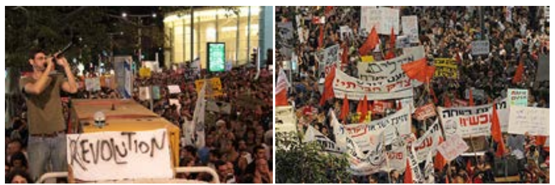
Israel, mid-2011: Hundreds of thousands of Israelis take part in massive, Occupy-style protests against the lack of affordable housing and poor public services. A communist party must be built in Palestine/Israel that can lever a component of the Jewish-background workers angry at the effects of capitalism up to a perspective of uniting with the Palestinian people around a program of opposing the Zionist state that both enforces capitalism and subjugates the Palestinian people.