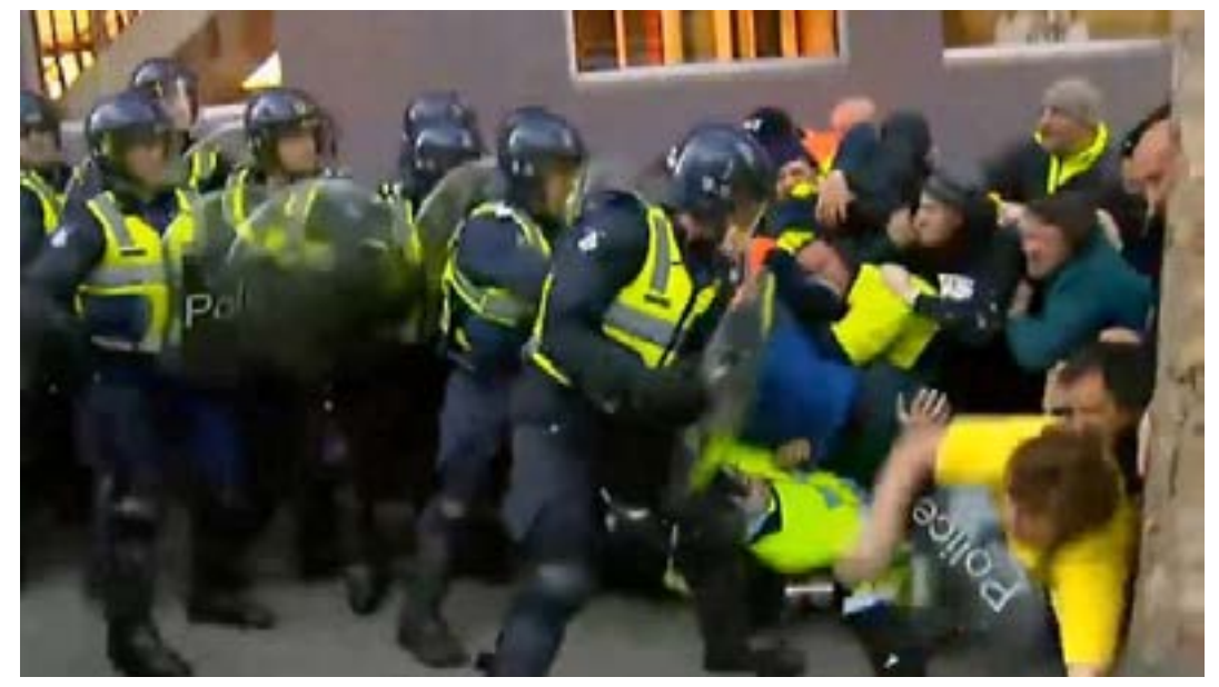
Melbourne, 2012: Police in riot gear attack strike action by members of the CFMEU construction workers union who were fighting to defend workplace safety conditions at the Myer Emporium site. The same police that unleash racist violence against Aboriginal people are the ones that attack the struggles of the working class. It is in the very interests of the workers movement to stand by their Aboriginal sisters and brothers in opposing cop terror.